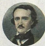
Edgar Allan Poe (1809–1849) helped invent the horror genre. His stories are still popular today.

SD1: The lights fade to black and all falls still. ●